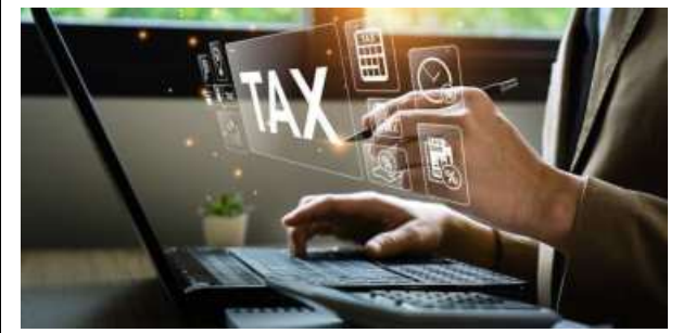
ELIGIBLE APPLICANTS. Income earned between April 1, 2024, and March 31, 2025, will be reported using these forms