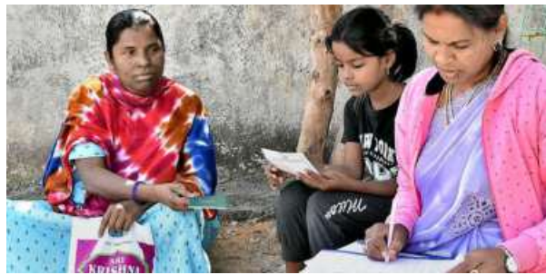
The Congress had been demanding a caste count and such exercises had been announced in Congress-ruled States.

The Congress had been demanding a caste census for some time, and such exercises had been announced in Congress-ruled States, including Karnataka and Telangana, where surveys have reportedly been completed. Prime Mi-