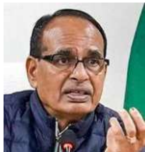
Shivraj Singh Chouhan

Addressing a press conference, Mr. Chouhan alleged that the Opposition alliance, including the Congress, was engaged in a "rat race" to take credit for a decision made by the Un-