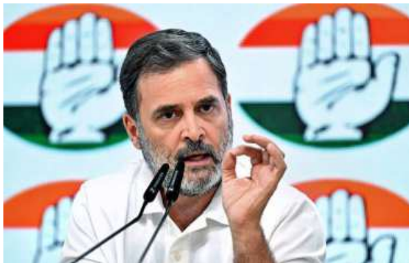
HANDS ON. Leader of the Opposition Rahul Gandhi addressed a press conference at the All India Congress Committee office in New Delhi on Wednesday.

His comments came hours after the BJP-led NDA government made an announcement approving caste enumeration in the country's