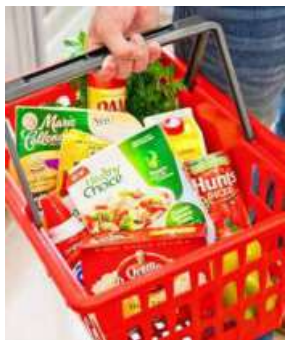
The tool facilitates easy submission of details such as front-of-pack images

The tool facilitates easy submission of essential details such as front-of-pack images highlighting the misleading claim, the FSSAI licence or registration number of the manufacturer, and the e-commerce URL if the